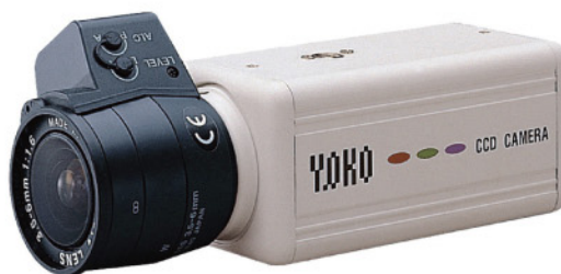
• RYK-275F / 272F / 277F